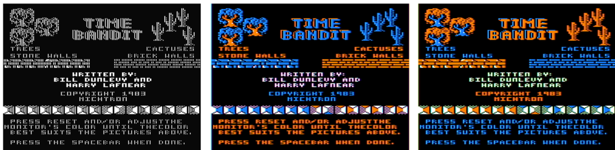
Figure 1.2: Time Bandit , Dunlevy & Lafnear, 1983 in different cross-colour modes