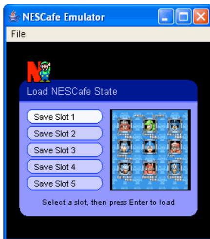
NES Cafe Load State Menu Screen (press F5)

Finally, you can configure the format of the Movie Files that are produced when you press F8 and can choose whether you wish to save only the key-presses (resulting in smaller movies), or whether you wish to record a full animated GIF.