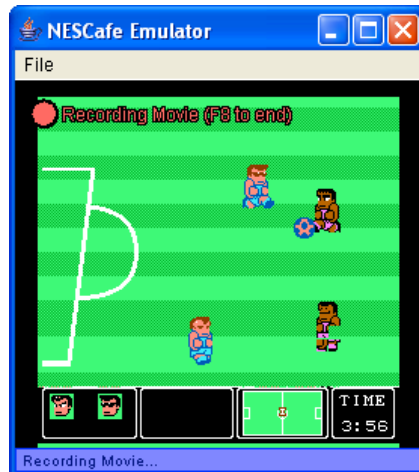
Recording a Game