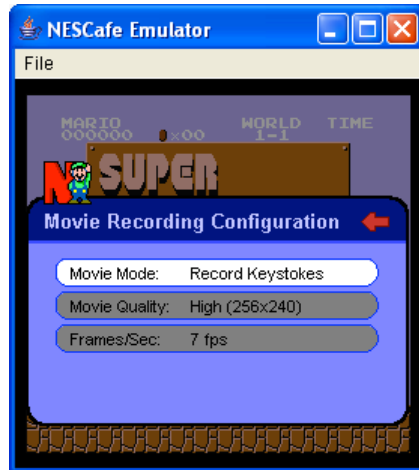
Configuring the Recording Format for Movies