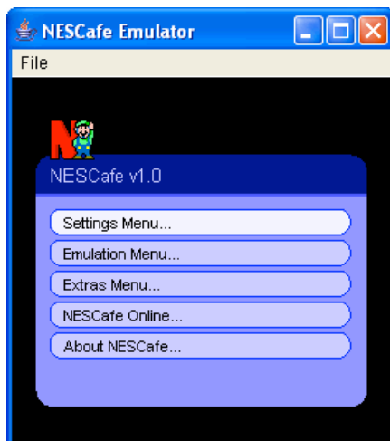
The NES Cafe Main Menu (press ESC to access)

When you run NES Cafe it will start up and load the default NES Cafe game (unless you have instructed otherwise). This contains a waving Mario. Use this to test the controls by pressing any of the control keys (by default these are Enter, Space, Z or X) to see the screen flash.