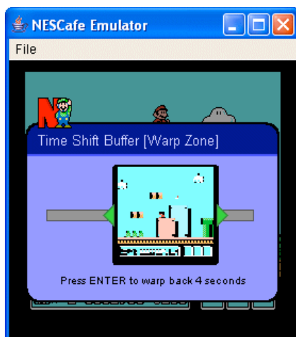
NES Cafe Time Shift Buffer Screen (press Back-Space)

The Save State Screen of the Emulation menu is shown on the left. You can Save a State into one of the available slots for each game. When you go to Load a previously saved state you can cycle through the available slots by pressing the UP and DOWN arrows on your keyboard.