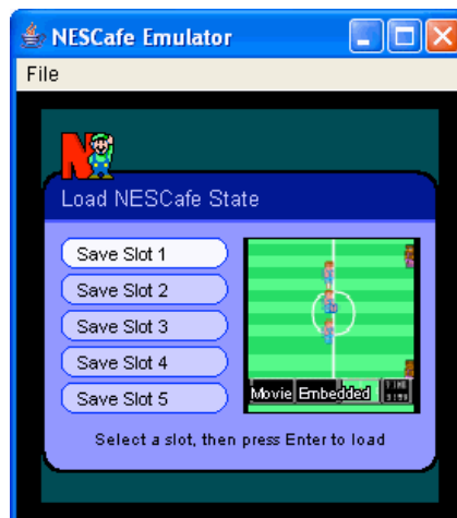
Playing a Movie Back